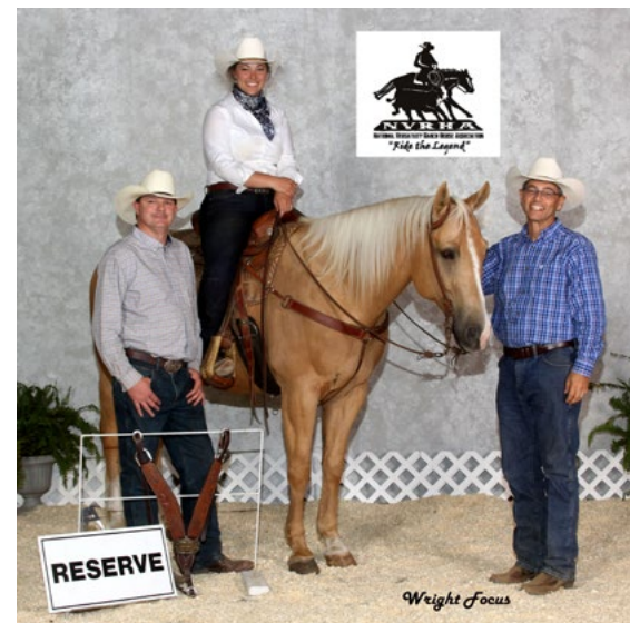
GOLDEN H MISTER T