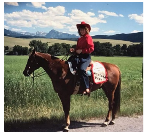
MISS LIVINGSTON ROUNDUP RODEO QUEEN RIDING MONTE