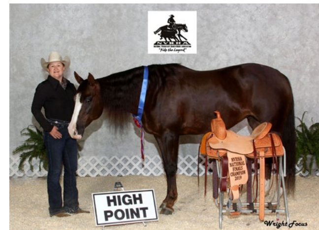
BOOGERS LITTLE FANCY