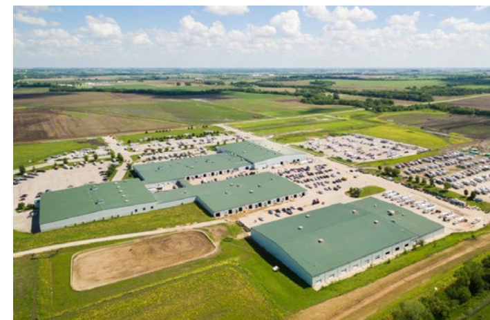
LANCASTER EVENT CENTER: Lincoln, NB