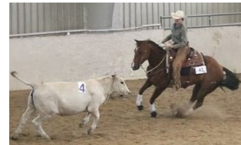
LIL RED JOLENE