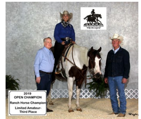
PISTOL PACKIN PICASSO