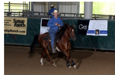
DOCS SHINEY PISTOL