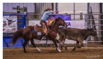
NM 2019: Meranda Wood Nickel & Cody Henderickson